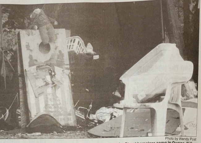
On Tuesday, Sept. 24, 2024, multiple agencies arrived at the Foundry Street homeless camp in Owego, NY. to post the property as a threat to public health, and to offer services and assistance to those residing there. A small handful of residents that aren't interested in county assistance were required to vacate in 24-hours.

department's attention that people living in temporary