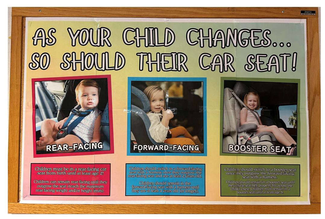
Bulletin Board: Health & Human Services Building, September 2024