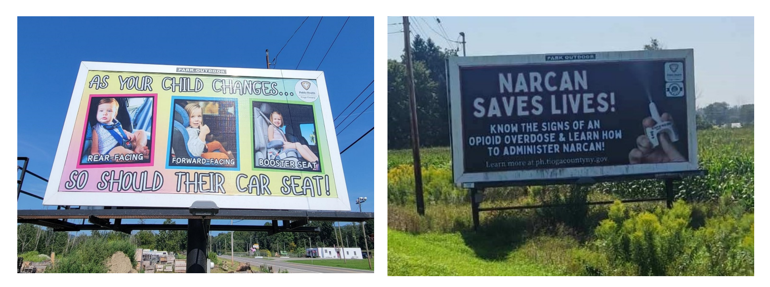
Billboard Design, Various locations, September 2024