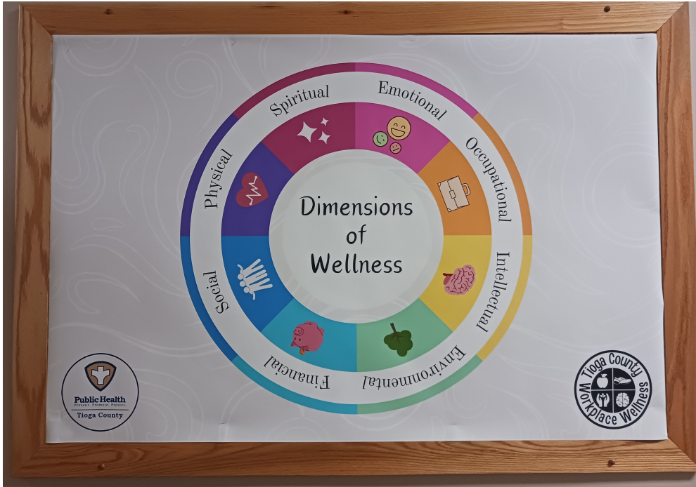
Workplace Wellness Bulletin Board, 56 Main Street, Owego, December 2023