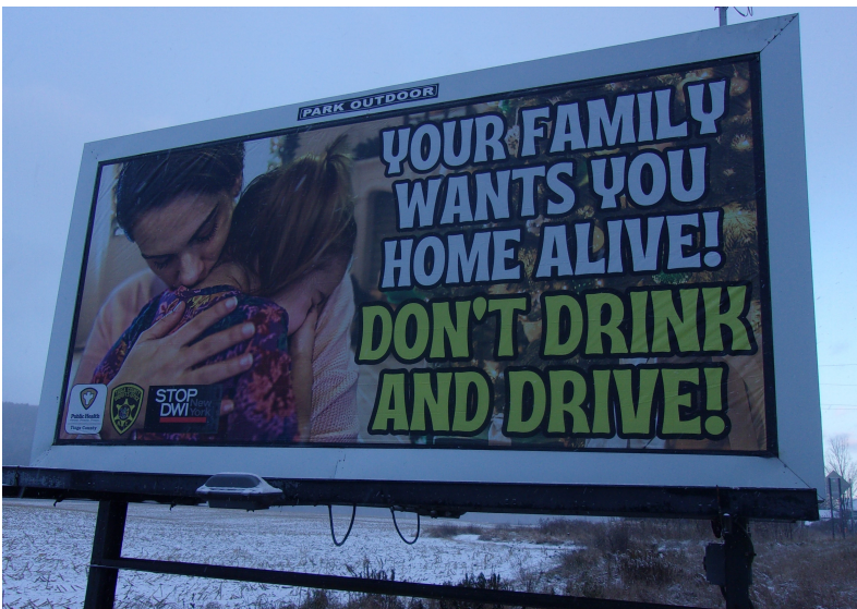
Billboards, Various Locations, December 2023